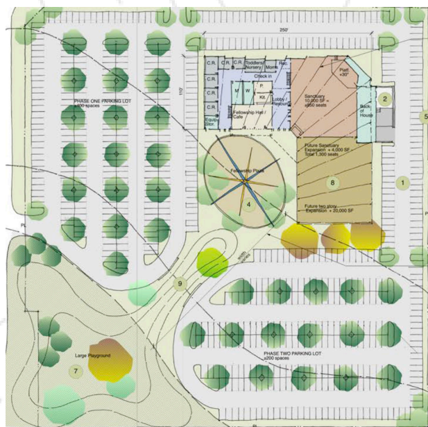
Architect rendering of a potential building site

We want to devote our time and energy to the task of making disciples, and we want the freedom to be able to do that at any time throughout the week. In order to do this, we need a 24/7 facility. As we have looked throughout our community, we have not found any existing or available facilities that would meet these needs. Therefore, we believe purchasing land and building a new facility is the best option.